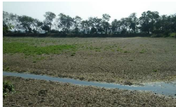
Shallow pond converting to cultivable land (during winter)