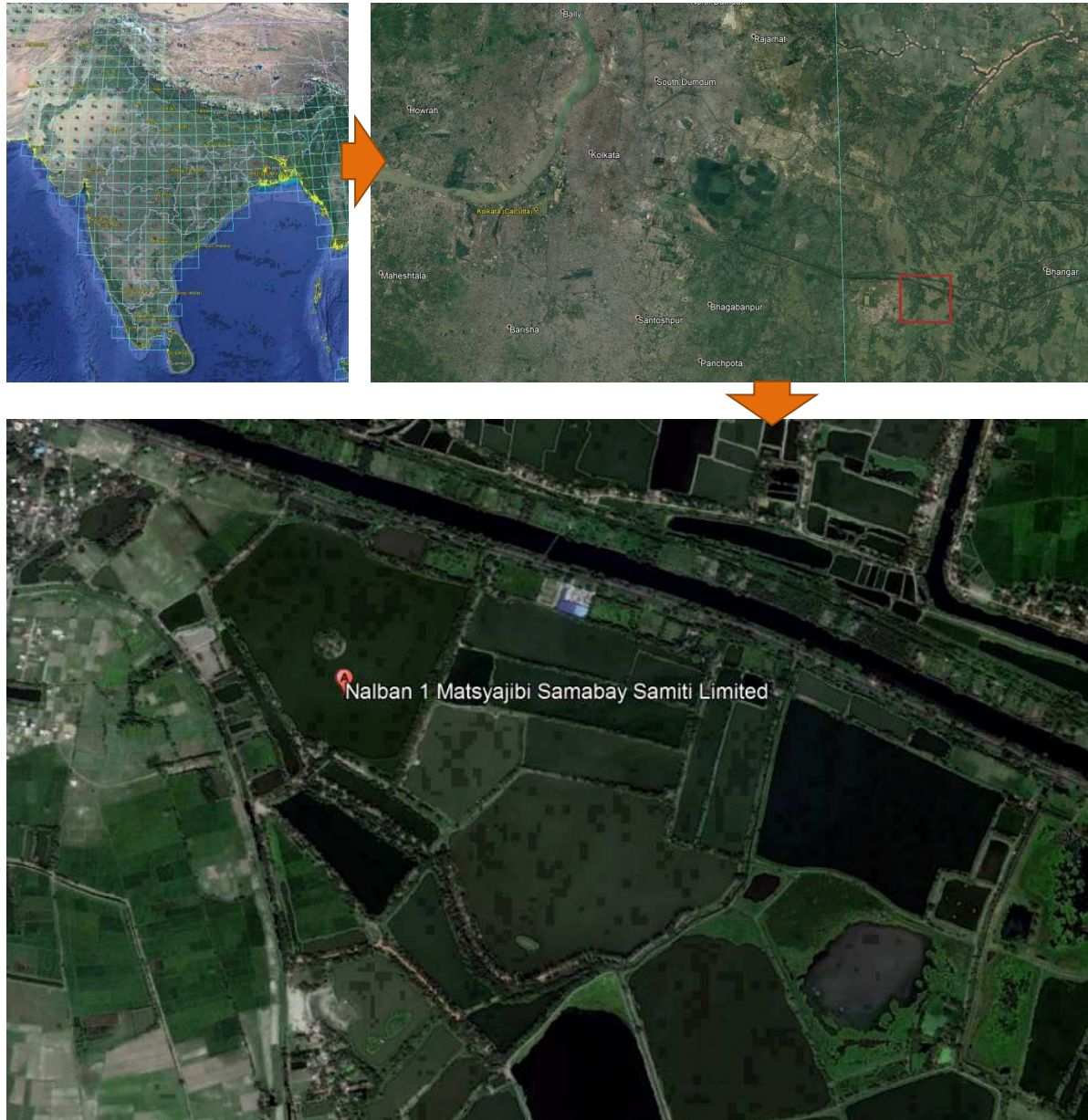
Fig. 1: Location Map of the Study Area around Nalban-1