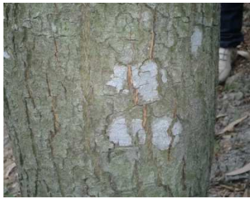
Lichen in the tree trunk