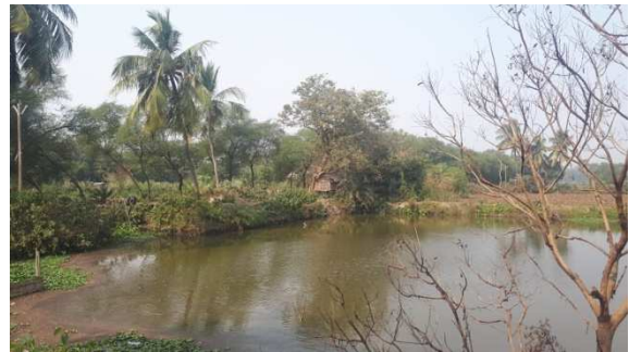
Ponds ready for pisciculture