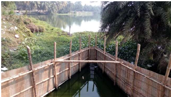
Bamboo net between feeder canal and pond to prevent fish from escaping