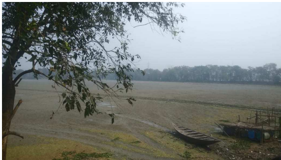
Ponds under preparation stage