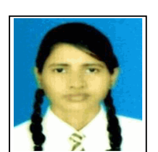
low siet being