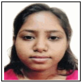
Sley a Grhosh